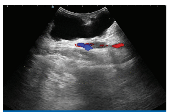
[Table/Fig-3]: Color Doppler showing an anechoic cystic lesion with few internal echoes. No color flow within the lesion, confirming the cystic nature of the lesion.