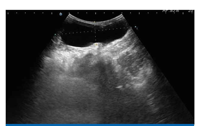
[Table/Fig-2]: Ultrasonography showing a fluid filled cystic lesion of approximate size 9.2x6.2 cm lying in the subcutaneous plane in the left inguinal region.

The patients consent was taken for radiological examination of the involved area. On ultrasonography, using a high frequency liner transducer in the longitudinal and transverse planes, we found a fluid filled cystic lesion of approximate size 9.2x6.2 cm lying in the subcutaneous plane in the left inguinal region extending from anterior superior iliac spine laterally to the symphysis pubis medially [Table/Fig-2]. There was no communication of the lesion with the peritoneum. There was no change in the size of the swelling with Valsalva maneuver.